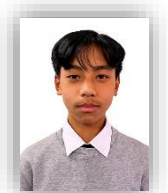
Dütüh Swüro Cass-VIII

Anyhow I persuaded to comply, To embellish the tale And etched on my art gallery; As to become my untold story.