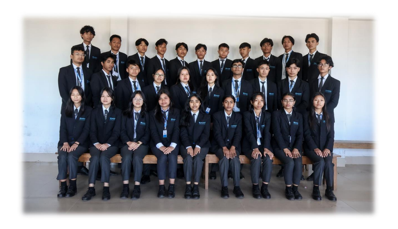
CLASS 12 SCIENCE