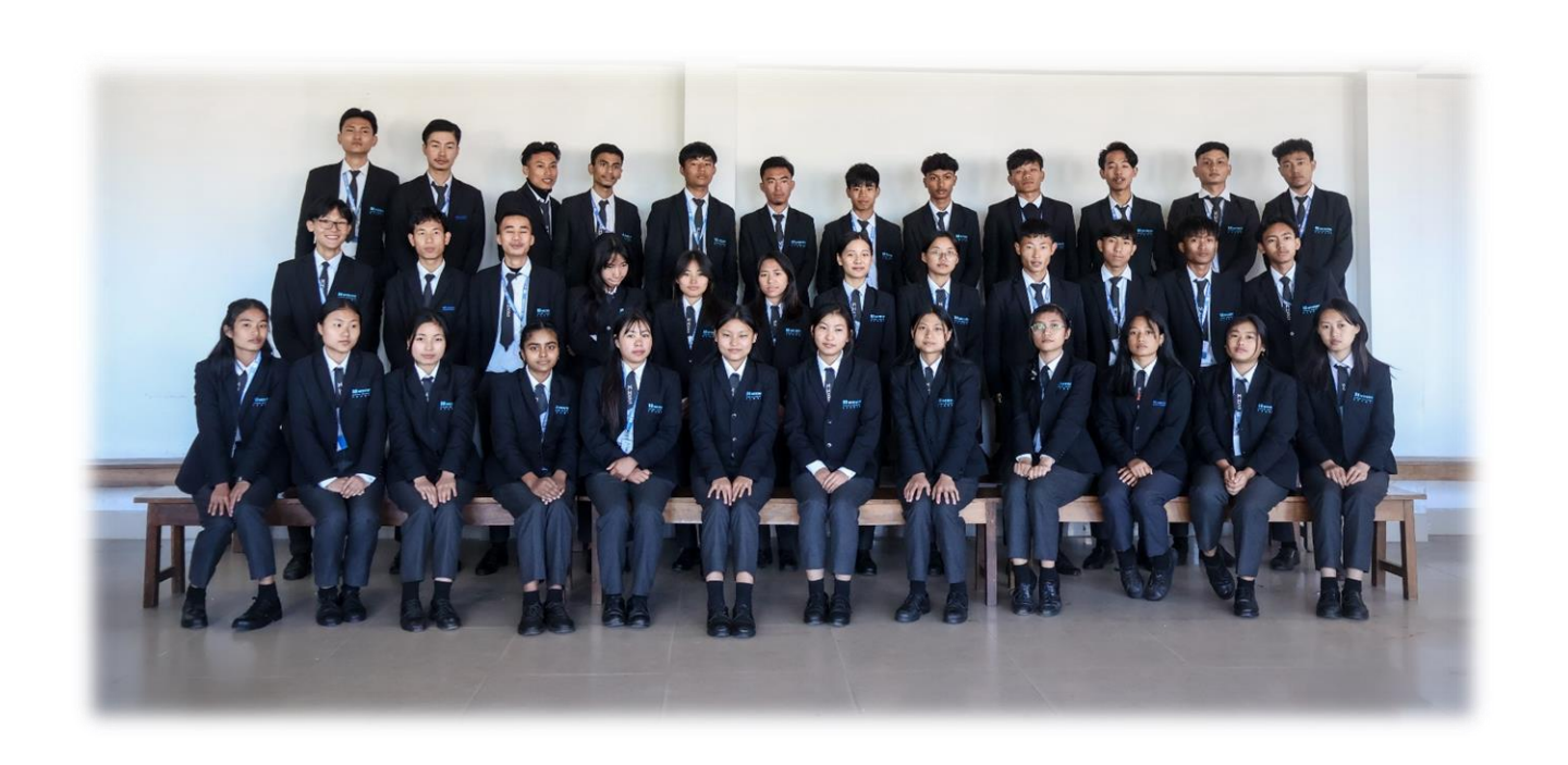
CLASS 12 ARTS 'B'