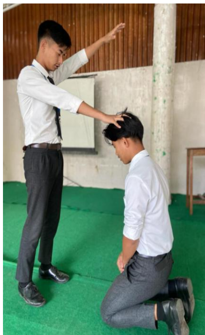
Youth Pastor Anointed