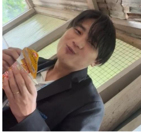
Cup noodles the best