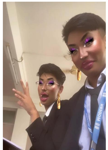
Aunties of 12 Science