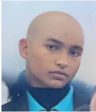
Then what am I?