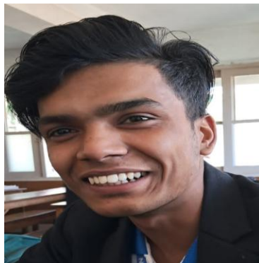
How. Like this?