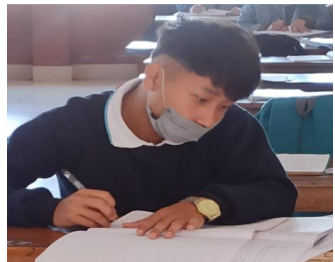
Don't disturb. I'm writing notes