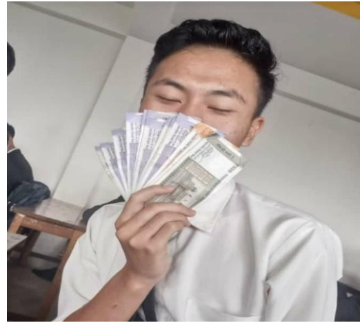
Legend says it, I'm richer than Ambani.