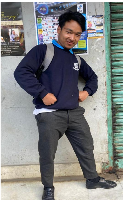
Modern Next Top Model Pose.