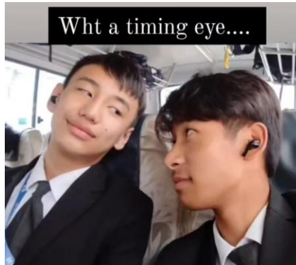
Look into my eye