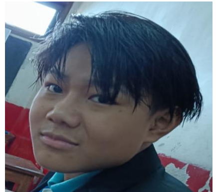
Stop this at once.