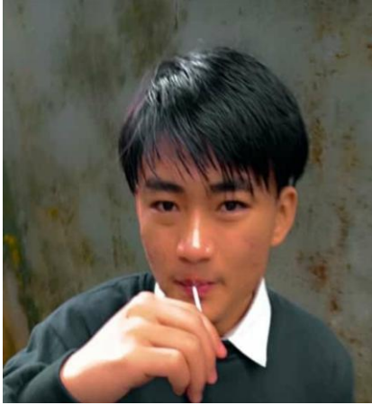
I love lollipop