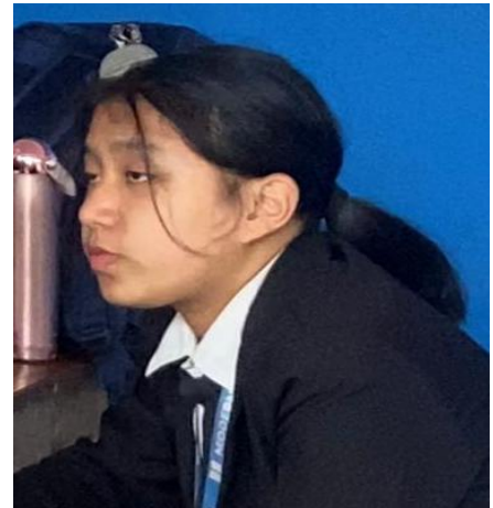
I want to sleep too.