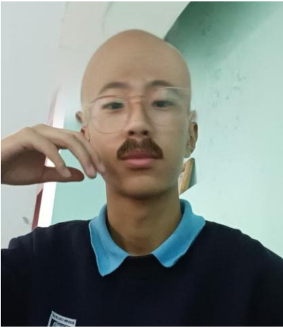
I am Gandhi