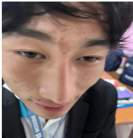
I want to sleep.