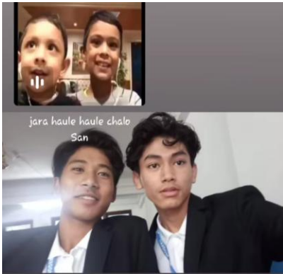
We are best duo