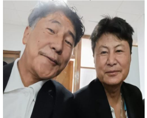
Best uncles of Modern