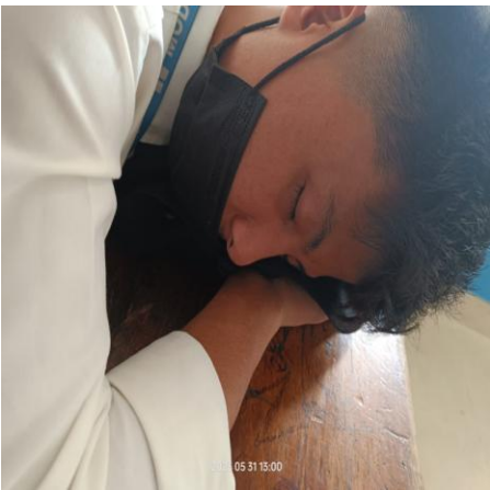
Don't Disturb me, am sleeping.